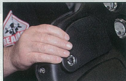
It's necessary to remove the fairing "clam shell" to install the speakers, which come with attractive covers containing tweeters.